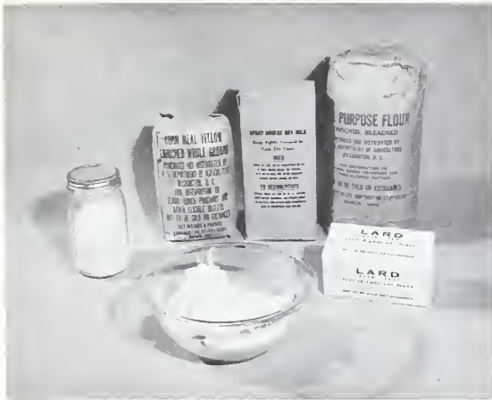
N-39883--A cornmeal baking mix combines several donated foods.